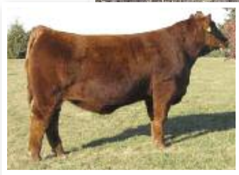
RRA Absolute Power 125 Half brother to Lot 1 and Flushmate to Lot 2