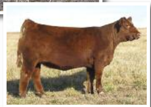
RRA Phyllis 47 116 Half Sister to Lots 1 and 2.