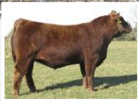
RRA Crimson Tide 135 Half brother to Lots 1 and 2.