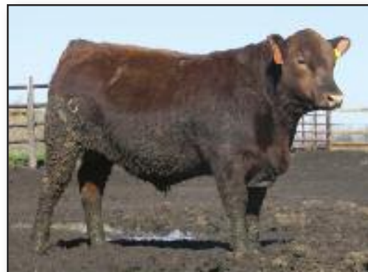
Bar G Packer Y104 • Lot 22