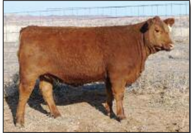
Bar G Vicila Y307 • Lot 64

This heifer originates from the Vicila cow family bred for generations by the RA Brown Ranch. Her dam has consistently produced a top heifer calf each year and 2011 was no different. X307 is moderate sized with good depth of rib and a stylish look.