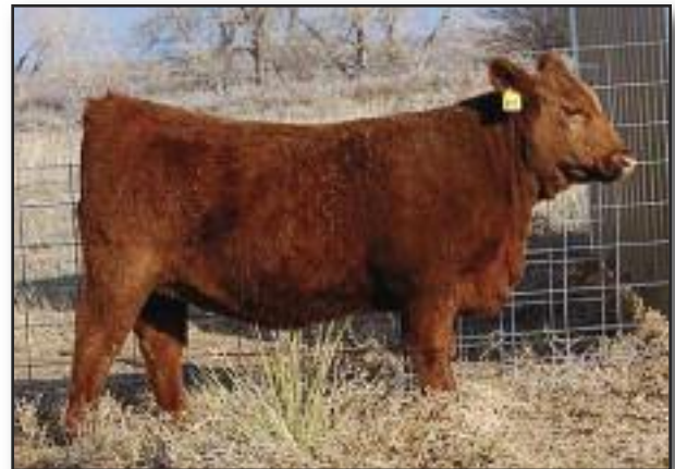
Bar G Vicila Y714 • Lot 71

This heifer is exactly what we envisioned when we mated Ms Monu P7931 to the 2009 World Angus Forum Grand Champion bull, Full Throttle. She is moderate framed with tremendous thickness and muscle expression. She shares the depth of body and long hip with her sire. She is a definite donor prospect and maybe the best heifer we have ever raised. The dam, Ms Monu P7931 was purchased as a three year old elite donor cow for $12,000 at RA Brown Ranch's 2007 sale. She is long bodied with tremendous muscle expression and high volume along with a fancy feminine front. She has been a prolific donor cow.