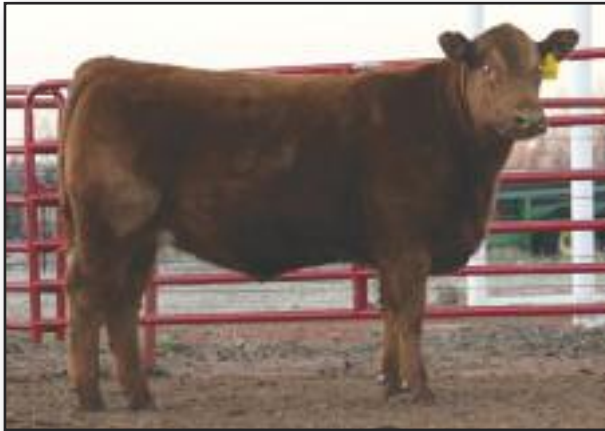
Fat Duke • Lot 84

Reg. #: 1471093 Calved: 02/17/2011 Tattoo: 1116 4MC 1A 100.0%