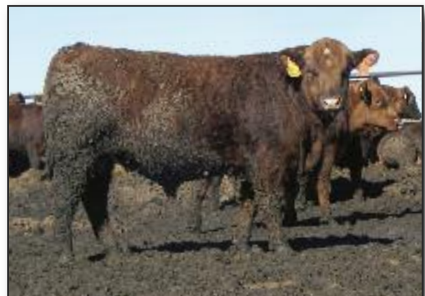
Bayblade • Lot 25