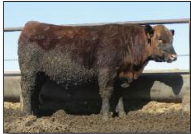
JCBB Reliant 096X • Lot 4