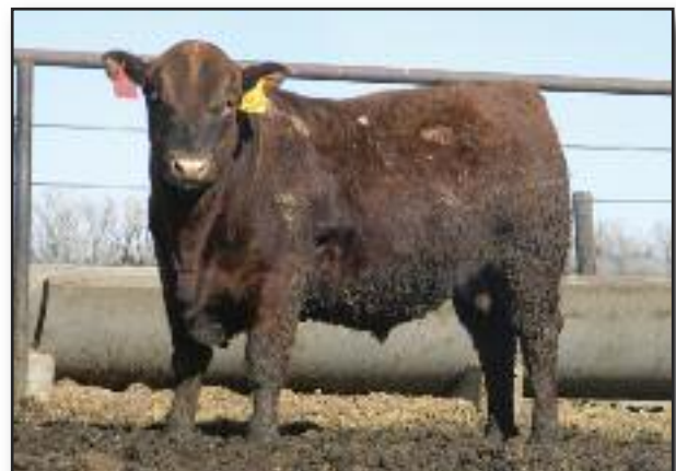
3J Elijah Y162 • Lot 44