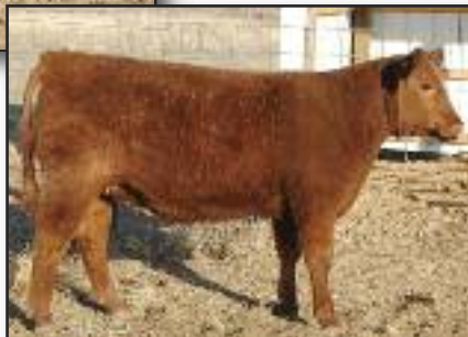
Bar G Vicila Y018 • Lot 73