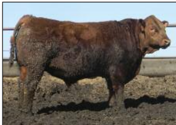
Bar G Full Throttle Y656 • Lot 33