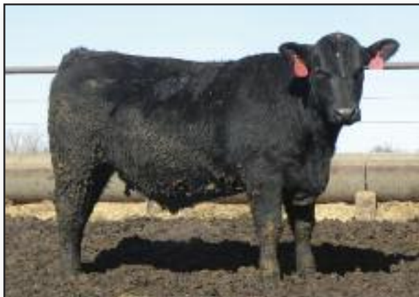
WW Ace of Spades 1110 • Lot 28