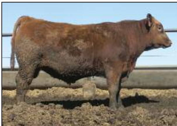
3J Dakbaro X410 • Lot 3