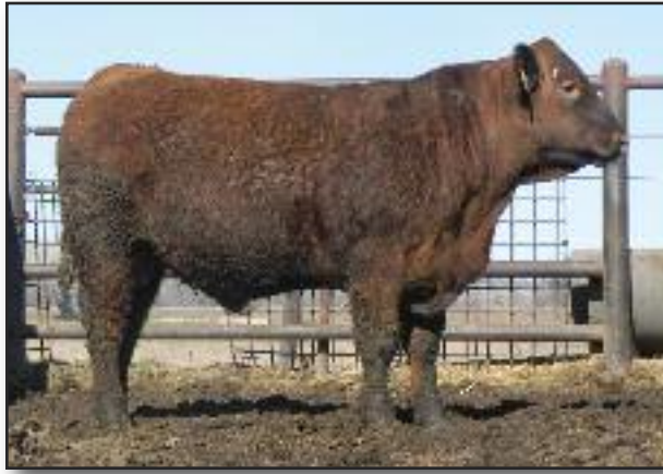
Chisel • Lot 26