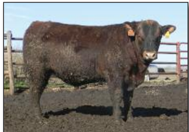
Bar G Sakic Y130 • Lot 24