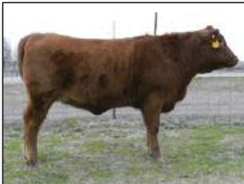
HL Carly 405Y • Lot 81

Wow, lots of genetic power here! Sakic stacked on a High Voltage dam. The number of breed greats in this pedigree is impressive, the renown BJR MS Stony 4X-516 just jumps out at you!