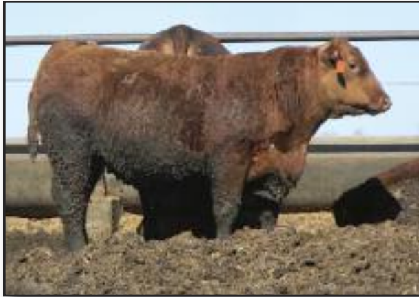
RJD Major Stout 7Y • Lot 27