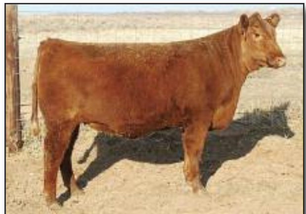
Bar G Lana Y482 • Lot 65

This heifer traces back to the Lana cow family bred for generations by Oates Land & Cattle. She is a larger framed calf that is easy fleshing with a square made hip and lots of style.