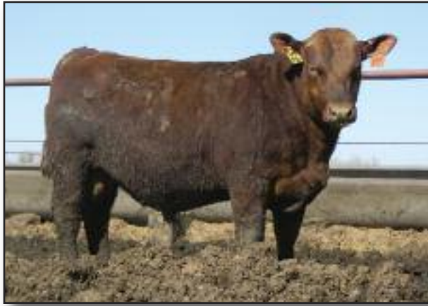
FLC Hamley 09 • Lot 1