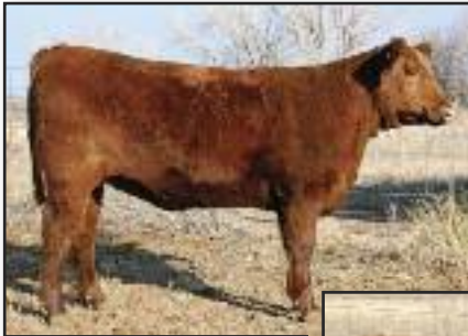
Bar G Vicila Y904 Lot 72

Y904 and Y018 are ET calves sired by Sakic. Both should make excellent brood cows. Great numbers and developed the way you would do it at home.