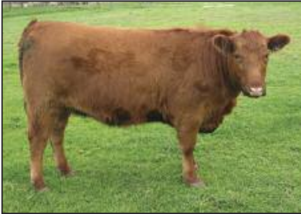
JCBB Sulphur Queen 086X • Lot 96

Reg. #: 1471887 Calved: 04/08/2011 Tattoo: Y59 3JF 1A 100.0%