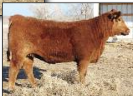
Bar G Abigail Y932 • Lot 69

Y932 and Y908 are full sibs and very stylish made heifers. Lots of balance in their EPD's with a splash of fresh genetics for our breed with Sakic's influence. These heifers along with Lot 66 are maternal sisters to the highest selling bull in the 2011 Red Alliance sale.