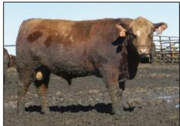
3J Oskar • Lot 6