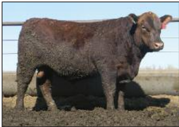
JCBB Mr. October 085X • Lot 11