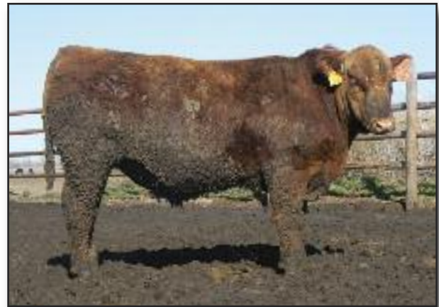
3J Ethan Y15 • Lot 23