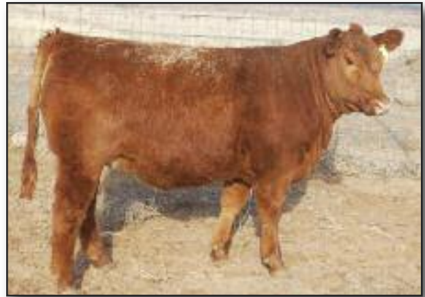
Bar G Dina Y416 • Lot 63

The Weber's purchased the Dina cow from Speer and Speer Red Angus as the "pick of the heifer crop." Her heifer calves have stood out each year being moderate sized and built right. This one is no exception with depth and capacity.