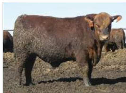
JCBB Milo 08X • Lot 16