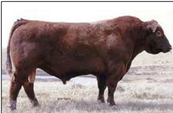
Red Towaw Indeed 104H • Semen sells as Lot 74