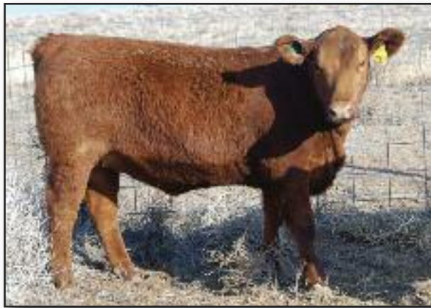
Bar G Abigrace Y100 • Lot 66