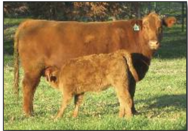
3J Ms Wildflower S91 • Lot 106

Here's a calving ease, low maintenance cow with carcass merit. She's EPD balanced to breed to a wide range of bulls. AI bred to Soo Line Momentum (1406832) on 1/21/12 - leadoff, champion bull at Soo Lines dispersal sale. Heifer calf (1467091) on side sired out of ever popular Mission Statement (960383) on 11/21/11. Her only bull calf scanned a 4.19% IMF & 14.24 RIB.