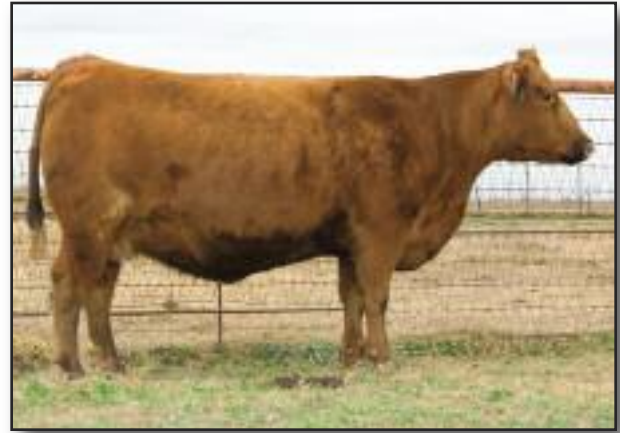
GMM Ms Cheyenne S3612 • Dam of Lots 67-69

Full sib embryos to Lots 67 and 68. Offering a package of 5 embryos with a guarantee of 2 pregnancies if implanted by a certified embryologist.