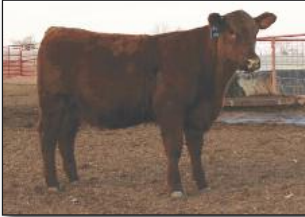
Code Bodi • Lot 83

Reg. #: 1422352 Calved: 03/16/2011 Tattoo: 409Y 44HL 1A 100.0%