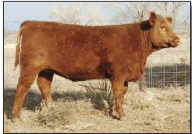
Bar G Vicila Y931 • Lot 70

This heifer is a natural calf sired by Ole Oscar. She is naturally thick and powerful like her dam. Ms Monu P7931 was purchased as a three year old elite donor cow for $12,000 at RA Brown Ranch's 2007 sale. She is long bodied with tremendous muscle expression and high volume along with a fancy feminine front. She has been a prolific donor cow.