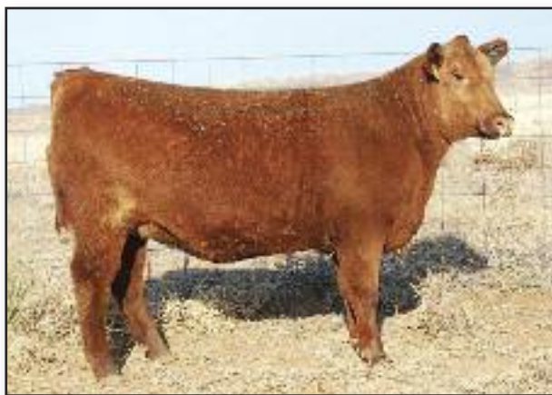
Bar G Abigail Y612 • Lot 67

Y100 is a great-granddaughter to the famed "Abigrace" cow at the RA Brown Ranch. She carries the thickness and muscle expression known for that cow family. This is a stacked pedigree with far more than the Abigrace influence to add value.