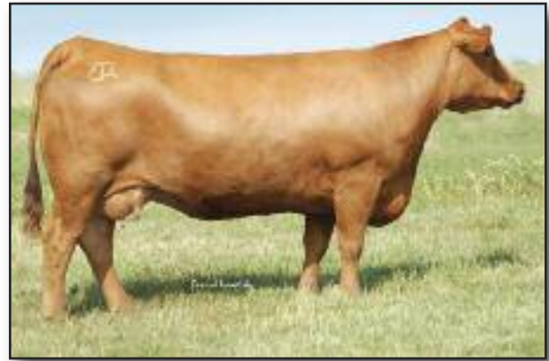
Brown Ms Monu P7931 • Dam of Lot 71

Lot 71B-2: Offering a package of 3 embryos with a guarantee of 1 pregnancy if implanted by a certified embryologist.