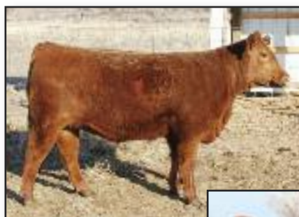
Bar G Abigail Y908 Lot 68

Y612 is deep-ribbed, long-bodied, calf with a lot of capacity. The Oscar progeny are in hot demand because so few are offered for sale. She is definitely the front pasture kind and a donor prospect. Take a look at how well balanced the EPD's are on this heifer!!