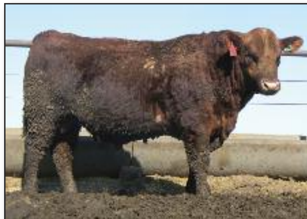
JCBB Root Berry 081X ET • Lot 12