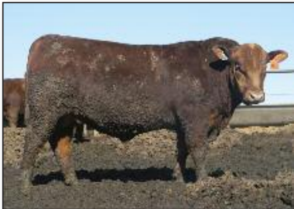
JCBB Western Sky 082X ET • Lot 2