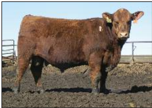
FLC Advancer 020 • Lot 9